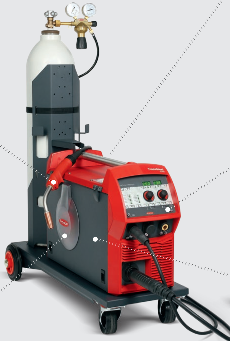
TRANSSTEEL 2500 COMPACT